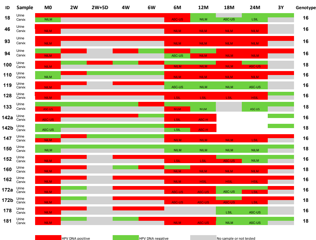
Figure 1. Schematic overview of HPV DNA results over the three-year follow-up period. The results obtained for home-collected samples are not included, but these results are provided in Figure S4. The sample ID of the participants is shown in the left column, and the HPV DNA results are provided for each participant; red: positive, green: negative. The top row also indicates the time-point of sampling during follow-up. M0 (month 0, start of the trial), W: week, D: days, Y: years. The right column indicates the HPV genotype—16 or 18. If a participant had HPV16 and HPV18 co-infection, the results for both genotypes are provided (e.g., 142a and 142b). The cytological results are provided for each collected cervical sample: NILM (Negative for Intraepithelial Lesion or Malignancy), ASC-US (Atypical Squamous Cells of Unknown Significance), ASC-H (Atypical Squamous Cells of Undetermined Significance cannot exclude High-Grade Intraepithelial Lesions), LSIL (Low-grade Squamous Intraepithelial Lesions) or HSIL (High-grade Squamous Intraepithelial Lesions).